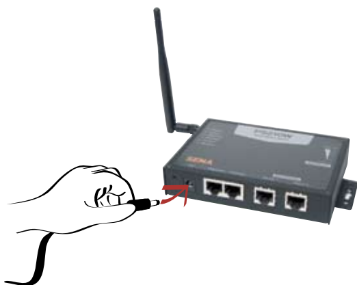
① Connect Power Supply